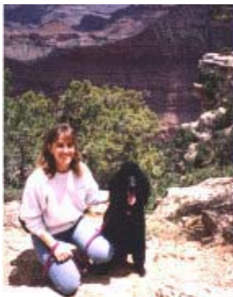
Photo at the Grand Canyon National Park, Arizona

National parks are one of the most visited destination spots in the United States for vacation travelers. Every year, millions of people visit their favorite national parks. But have you ever tried to bring your best friend along? The majority of national parks are not very welcoming to pets. But fortunately there are some exceptions, and some nearby dog-friendly national forests.